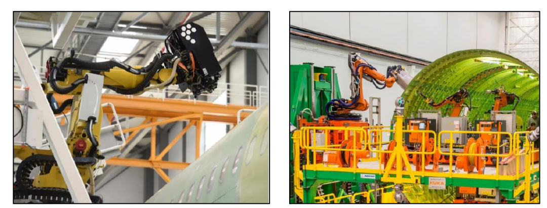
Figure 1. Examples of use of robotics in industrial applications [1].

Nowadays, collaborative robots are the new frontier of Industry 4.0 thanks to their versatility of application, but they still represent a challenge for the aviation industry, due to high reaction forces and vibrations, that can destabilize the collaborative robots during the process. To date, there are different contributions offered by the scientific community for the characterization of drilling and countersinking processes. However, traditional tests do not reproduce the real boundary conditions of the test articles, that deviate considerably from a real single structural unit. Moreover, vibrational phenomena caused by the tool-item interaction and possible interlayer gaps are underestimated. For these reasons, there is a high level of unpredictability of the final quality of the hole.